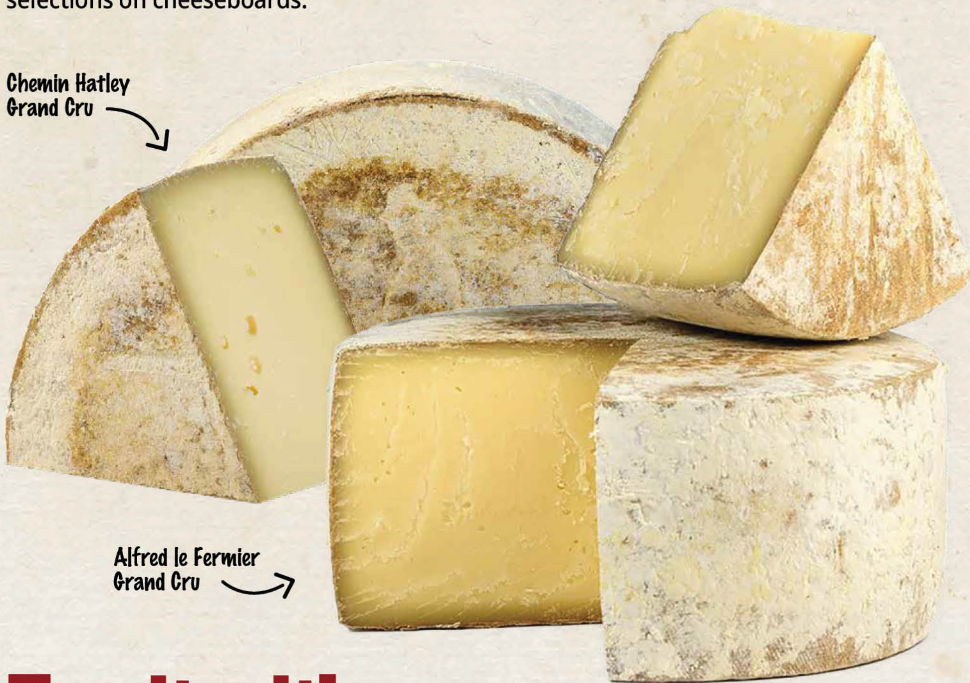
Alfred le Fermier Grand Cru