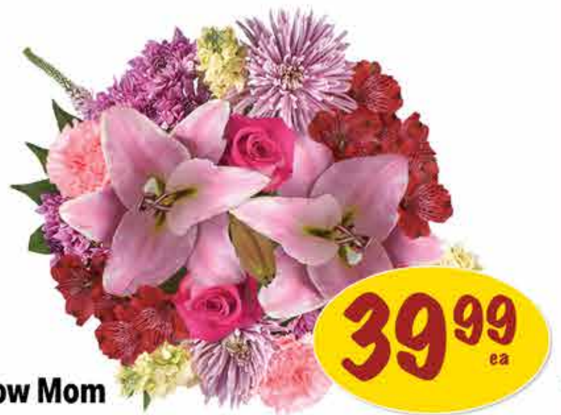
Wow Mom Bouquet