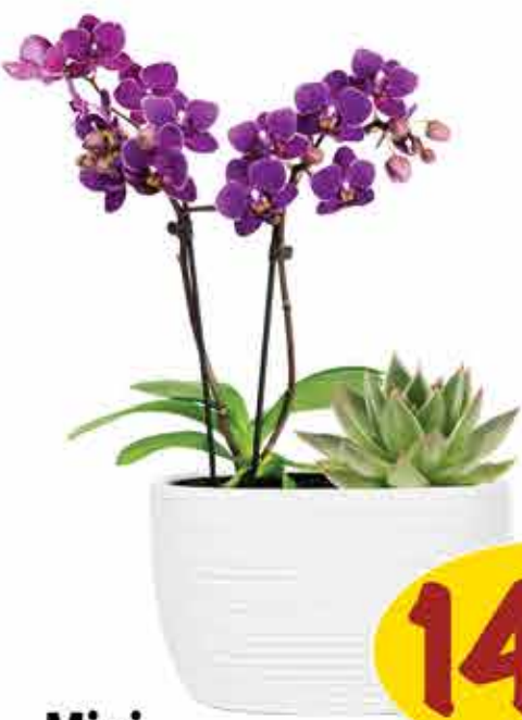
Mini Orchid Garden 4" pot