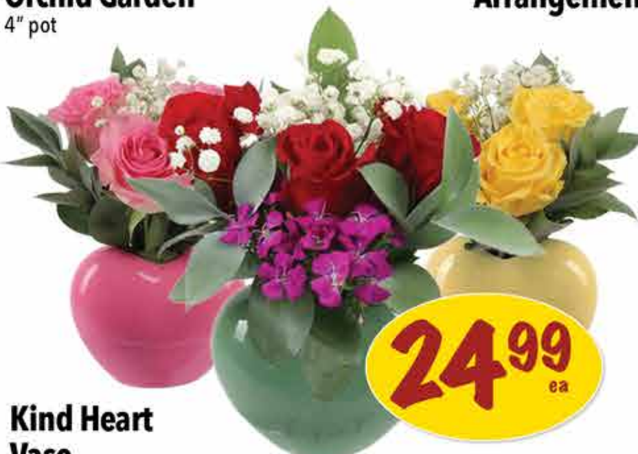
Kind Heart Vase