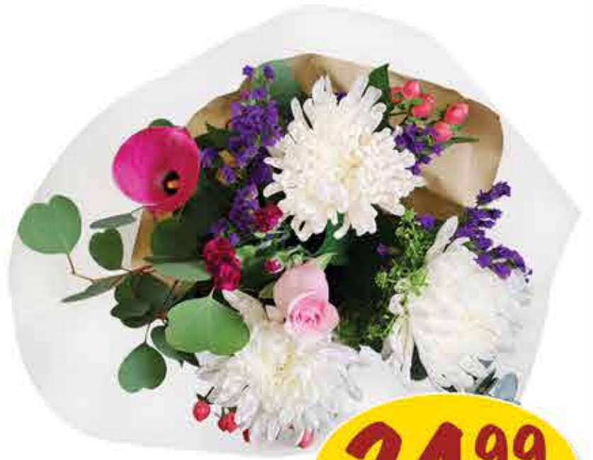
Farm Boy™ Bouquet