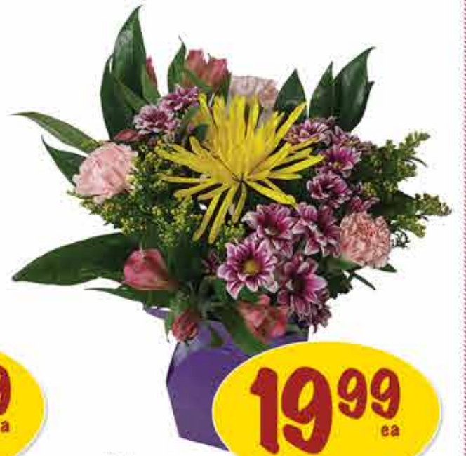
Bloom & Glow