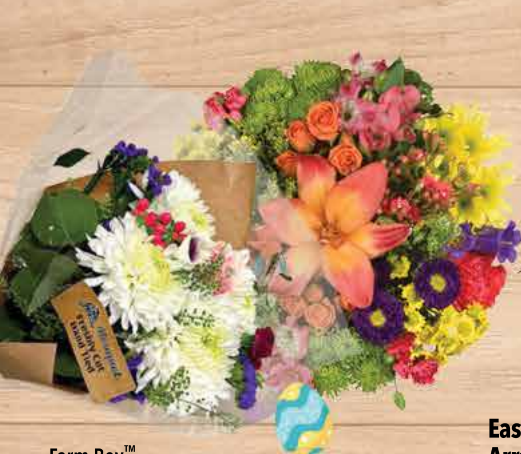
Farm Boy™ Premium Bouquets Starting at $16.99 Farm Boy™ Bouquet $24.99 Harmony Bouquet $34.99

Experience the aromas and colours of the season with our locally sourced flowers and plants. Great for gifting, add a delectable touch by pairing them with our scrumptious treats. Enjoy a unique selection of cakes, cookies, chocolates, and more!