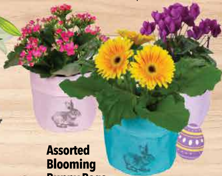
Assorted Blooming Bunny Bags $8.99 ea 4.5" pot