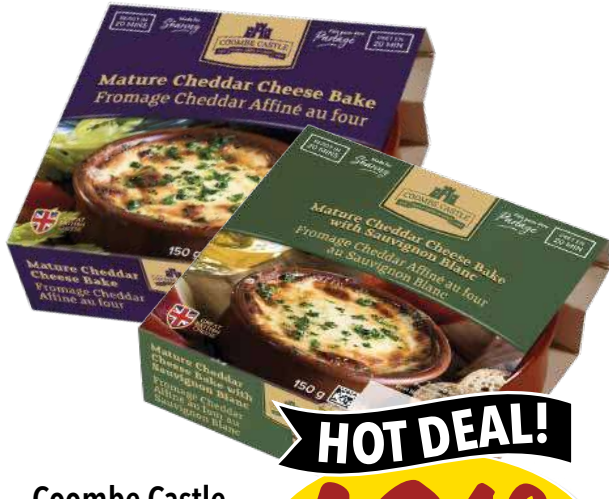
Coombe Castle Cheese Bakes all varieties, 150 g