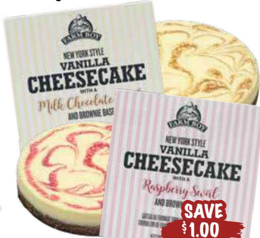
Farm Boy™ New York-Style Cheesecake all varieties, 500 g