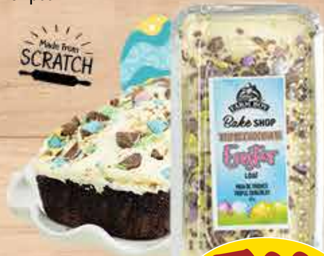
Farm Boy™ Easter Egg Triple Chocolate Loaf Cake 425 g