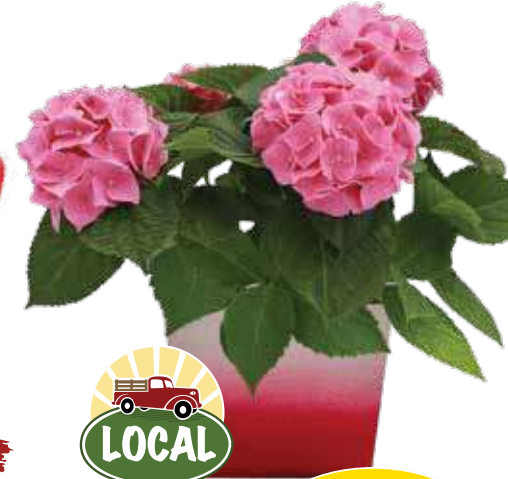
Bountiful Hydrangea Locally grown! 5" pot