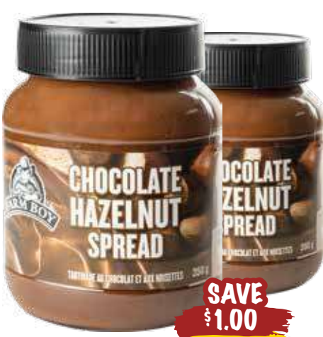
Farm Boy™ Chocolate Hazelnut Spread 350 g