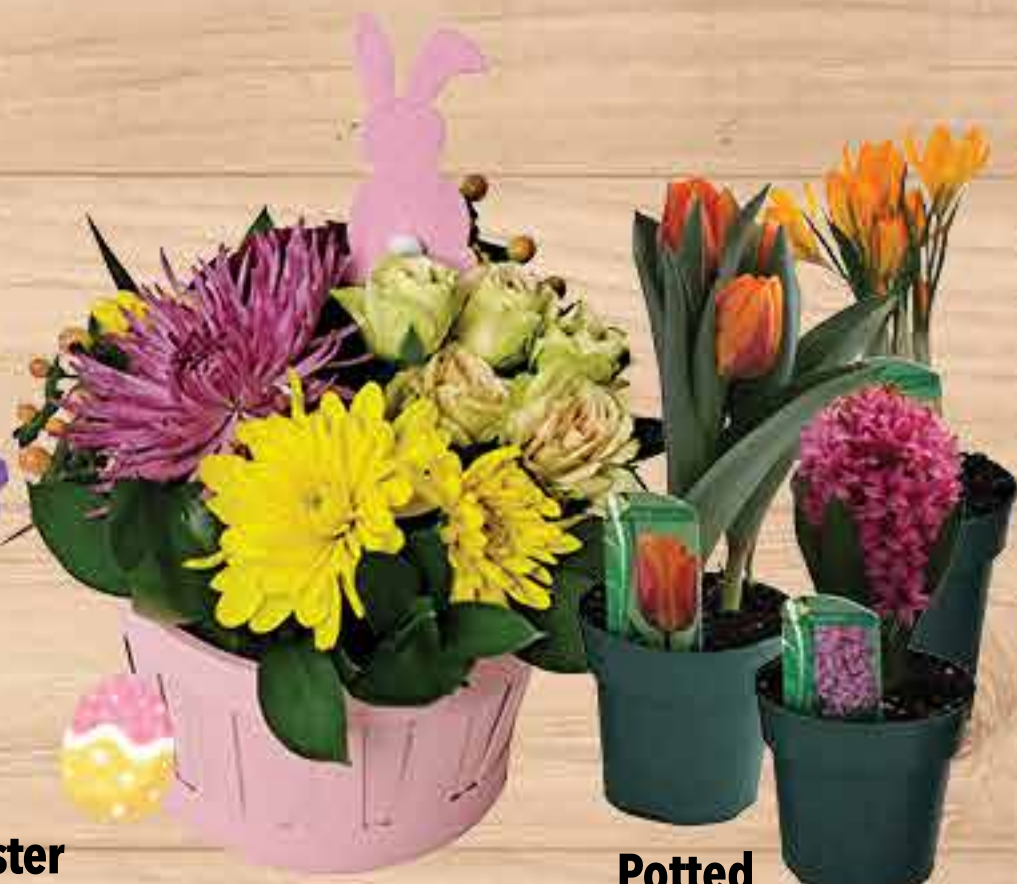
Potted Spring Bulbs $7.99 ea 6" pot