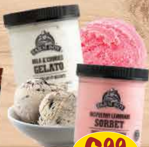
Farm Boy™ Gelato or Sorbet all varieties, 500 ml