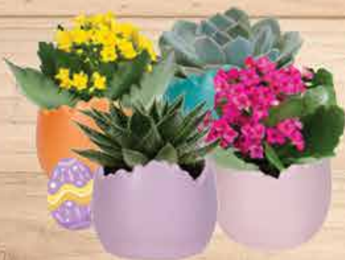
Kalanchoe & Succulent Mix in Ceramic Eggs $7.49 2.5" pot