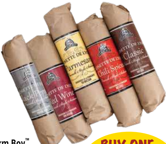
Farm Boy™ Rosette de Lyon $11.99 ea, all varieties, 300 g