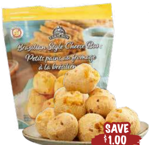
Farm Boy™ Brazilian-Style Cheese Buns 360 g