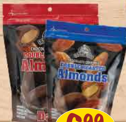
Farm Boy™ Chocolate Covered Double Roasted Almonds all varieties, 275 g