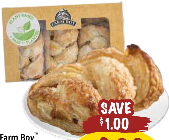
Farm Boy™ Plant-Based Strudels Apple or Cherry, pkg of 6, 400 g

Apples, cranberries, Farm Boy™ Mild Italian Sausage, and fresh bakery bread. $1.39/100 g