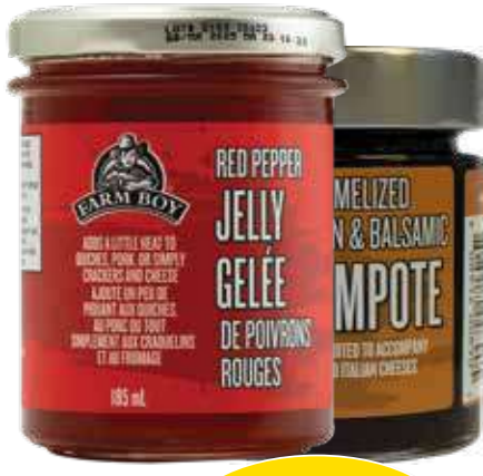
Farm Boy™ Compote or Jelly Jelly: $5.99, 185 ml Compote: $6.99, 150 g