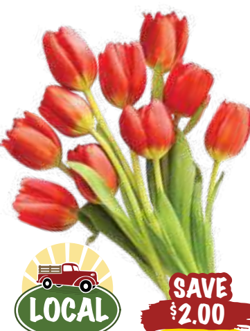
Fresh Cut Tulips Locally grown! 10 stems