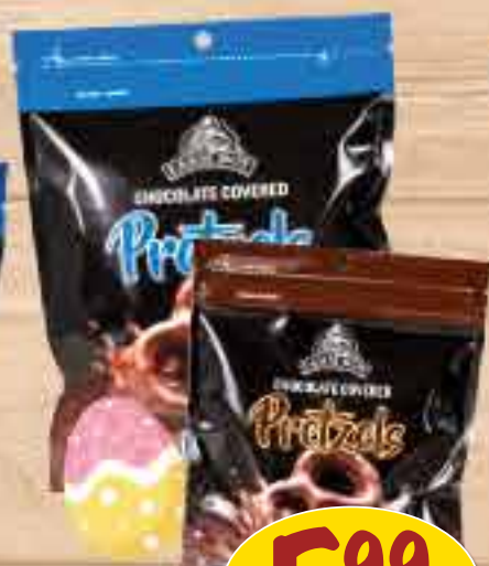
Farm Boy™ Chocolate Covered Pretzels all varieties, 180 g