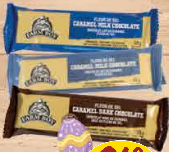
Farm Boy™ Fleur de Sel Chocolate Bars all varieties, 50 g