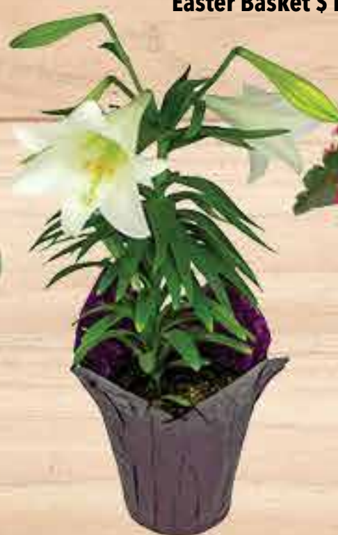
Easter Lilies Starting at $9.99 6" pot