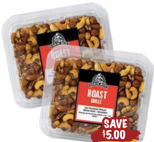
Farm Boy™ Premium Mixed Nuts 650 g