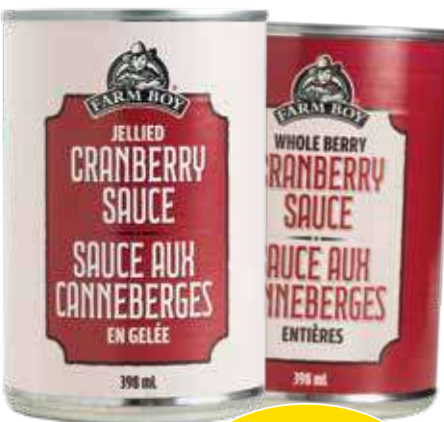
Farm Boy™ Cranberry Sauce Jellied or Whole Berry, 398 ml