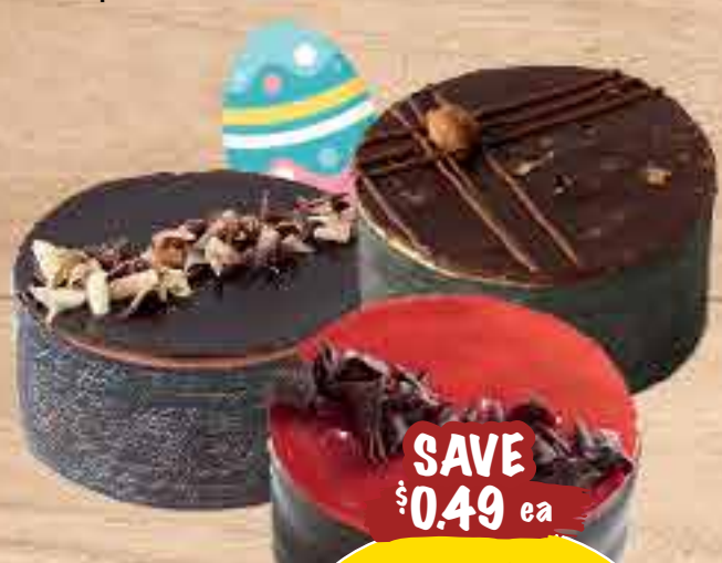
3" Mousse Cakes three varieties, 90 g