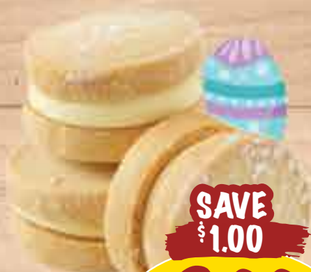
YoYo® All Butter Shortbread Cookies all varieties, 330 g