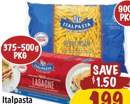
Italpasta Dry Pasta all varieties, 375-900 g