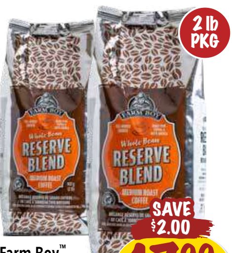
Farm Boy™ Reserve Blend Coffee Beans 907 g