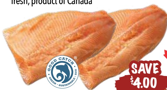
Arctic Char Fillets fresh, product of Canada, available at all stores except Blue Heron Mall