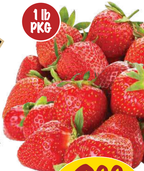
Sweet & Juicy Strawberries no. 1 grade, product of USA, 454 g