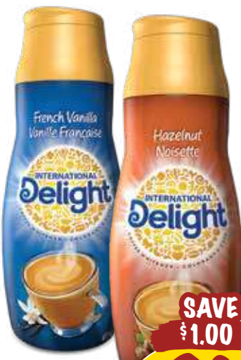
International Delight Coffee Creamer all varieties, 473 ml