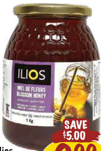
Ilios Blossom Honey 1 kg