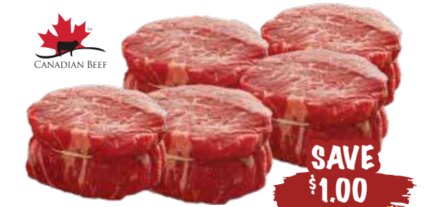
Cut from Canada AAA Beef Top Sirloin Medallions aged a minimum of 21 days