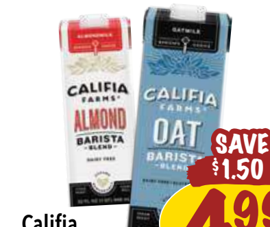
Califia Plant-Based Barista Blends all varieties, 946 ml