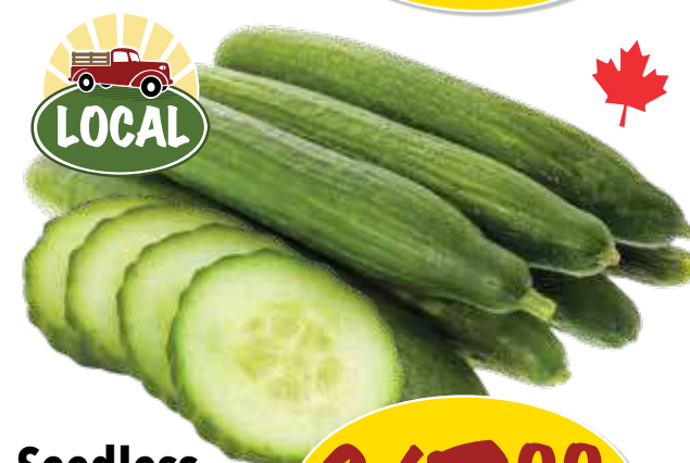
Seedless Cucumbers Canada no. 1 grade, product of Canada