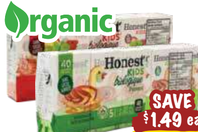
Honest Kids Juice Boxes all varieties, 5x200 ml