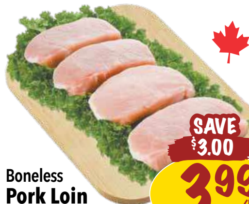
Boneless Pork Loin Chops or Roast fresh, product of Canada