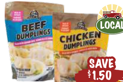
Farm Boy™ Dumplings all varieties, 500 g