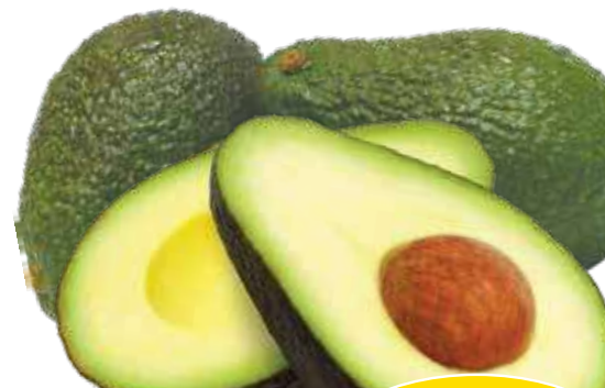
Large Avocados product of Mexico