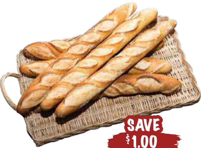
Crusty French Sourdough Baguette 325 g