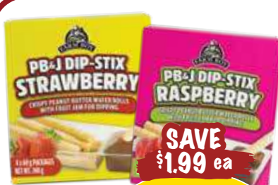
Farm Boy™ PB&J Dip-Stix all varieties, 4x60 g