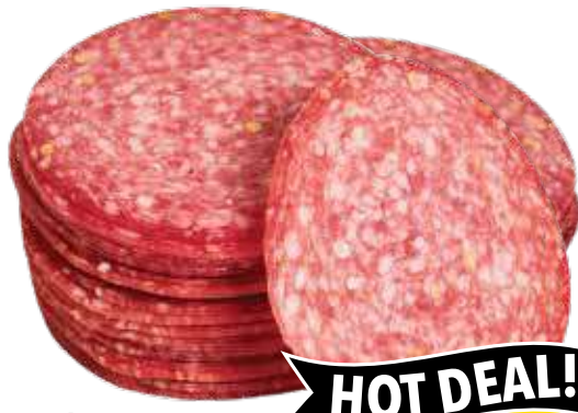
Schneiders Bagged Summer Sausage sliced fresh at our Deli Counter