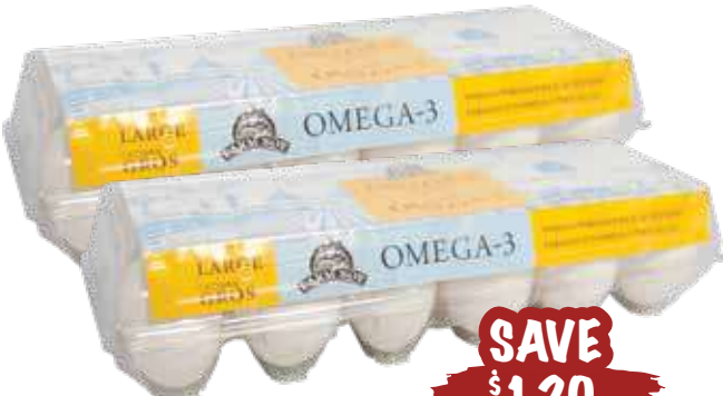
Farm Boy™ Large Omega-3 Eggs Canada grade A, 1 dozen