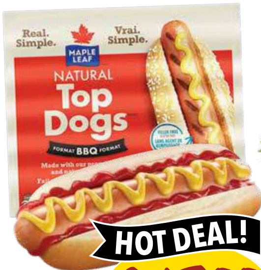
Maple Leaf Natural Top Dogs 375 g