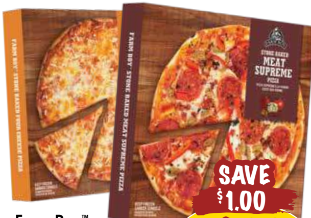
Farm Boy™ Stone-Baked Pizza all varieties, frozen, 330-375 g