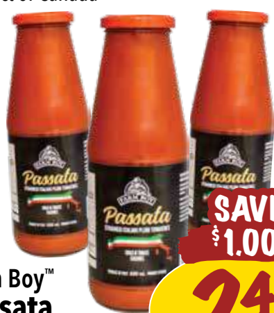
Farm Boy™ Passata 660 ml