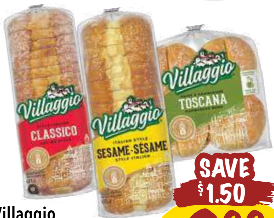
Villaggio Bread or Buns all varieties, 570-675 g or pkg of 6 or 8