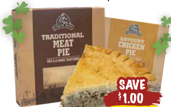
Farm Boy™ Savoury Pies Savoury Chicken or Traditional Meat Pie, 550 g

These delicious pies are made with hearty, simple ingredients that deliver satisfying flavour in every bite. Available in a Savoury Chicken Pie or our Traditional Meat Pie—crafted with high-quality beef and pork, onions, and traditional spices.