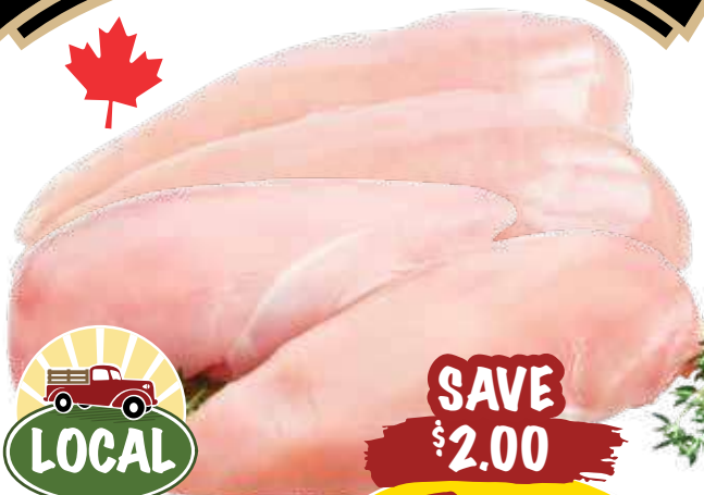
Boneless, Skinless Chicken Breast fresh, family pack size, product of Canada