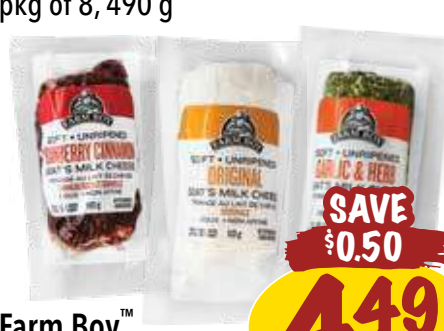
Farm Boy™ Goat's Milk Cheese all varieties, product of Canada, 113 g