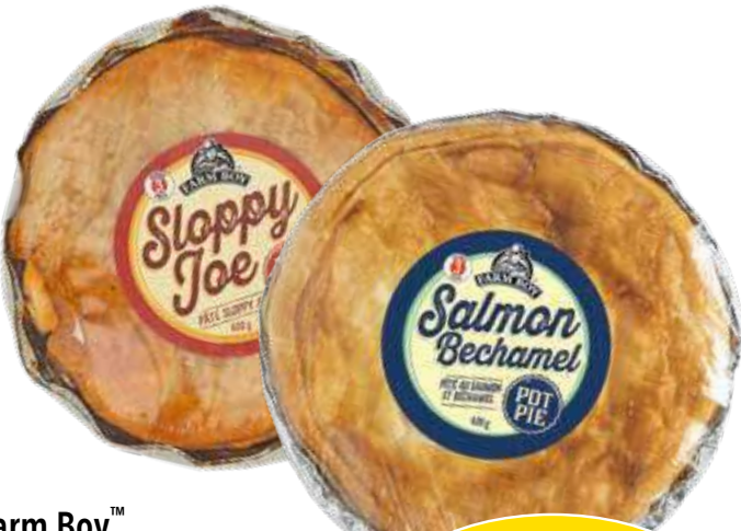
Farm Boy™ Salmon Béchamel or Sloppy Joe Pot Pie Salmon Béchamel: 620 g Sloppy Joe Pie: 600 g