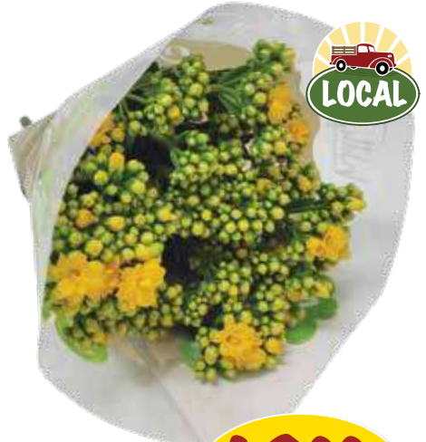
Fresh Cut Kalanchoe Locally grown! 3 stems