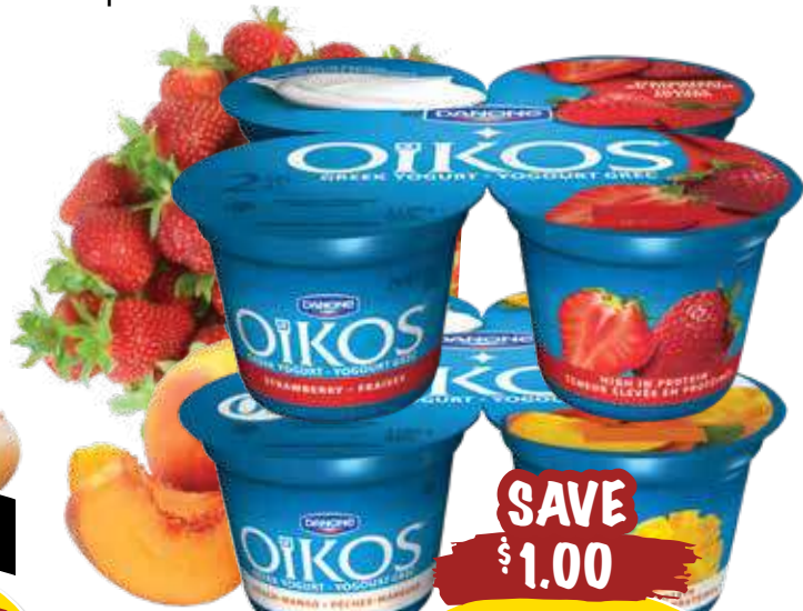
Oikos Greek Yogurt all varieties, 4x100 g