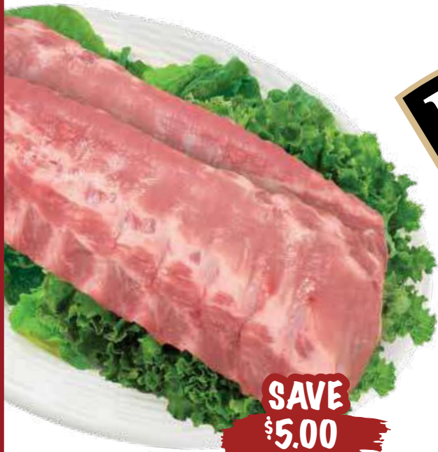
Fresh Pork Back Ribs cryovac pkg, product of Canada