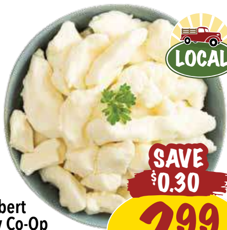
St-Albert Dairy Co-Op Fresh White Cheese Curds product of Canada