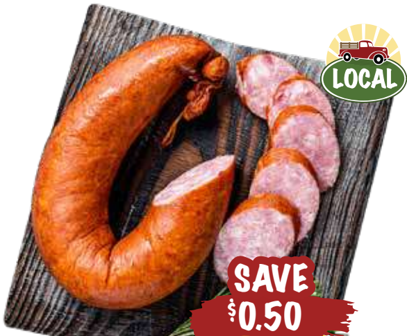
Brandt Kolbassa Coils all varieties, cut fresh at our Deli Counter