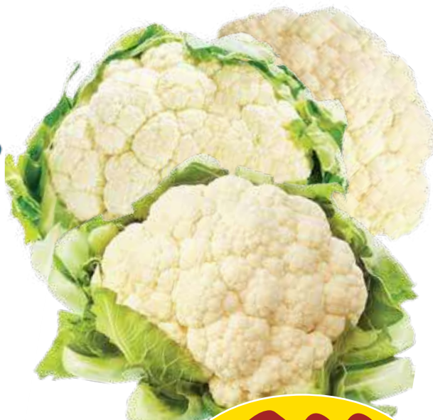
Crisp White Cauliflower no. 1 grade, product of USA