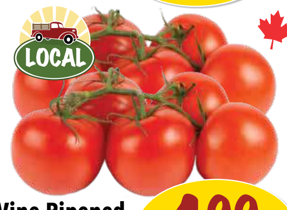
Vine-Ripened Tomatoes Canada no. 1 grade, product of Canada