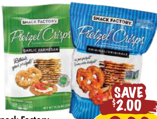
Snack Factory Pretzel Crisps all varieties, 200 g