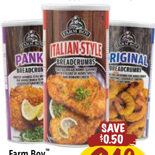
Farm Boy™ Breadcrumbs all varieties, 227-425 g