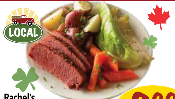
Rachel's Corned Beef Brisket product of Ontario