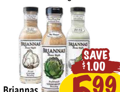
Briannas Home Style Dressings all varieties, 355 ml