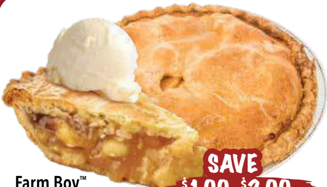
Farm Boy™ Freshly Baked Pies March 14 is Pi Day! all varieties, 8", 565-620 g