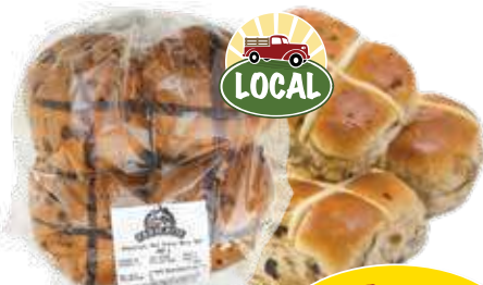
Traditional Hot Cross Buns Chocolate or Original, pkg of 8, 490 g