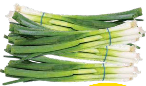
Green Onions product of Mexico/USA