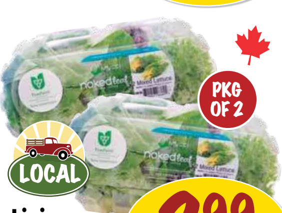
Living Lettuce product of Canada