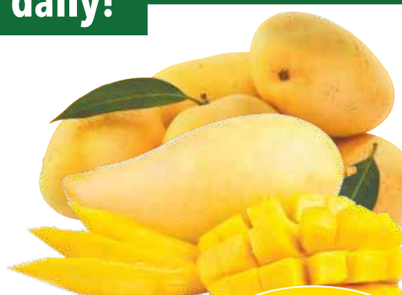
Ataulfo Mangos product of Mexico