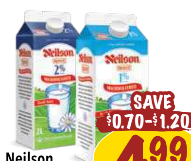
Neilson TruTaste Milk select varieties, 2 L