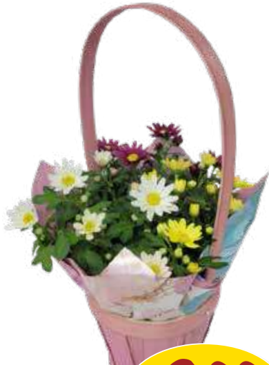
Fleurettes in Basket 4.5" pot