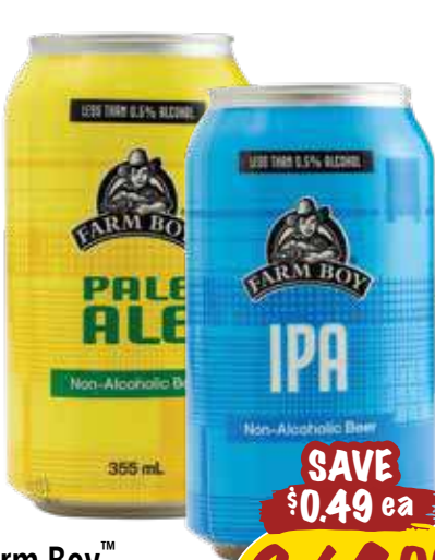
Farm Boy™ Non-Alcoholic Beers all varieties, 355 ml