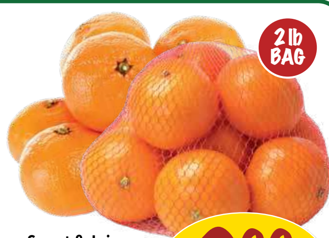
Sweet & Juicy Clementines product of Morocco/Turkey