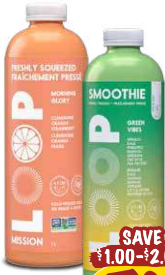
Loop Cold-Pressed Juices or Smoothies all varieties, 1 L