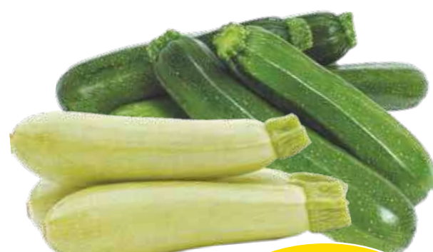
Green or White Zucchini product of Mexico