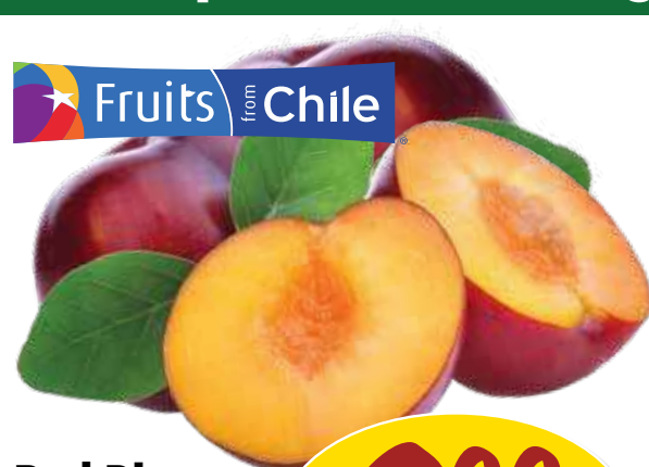
Red Plums no. 1 grade, product of Chile